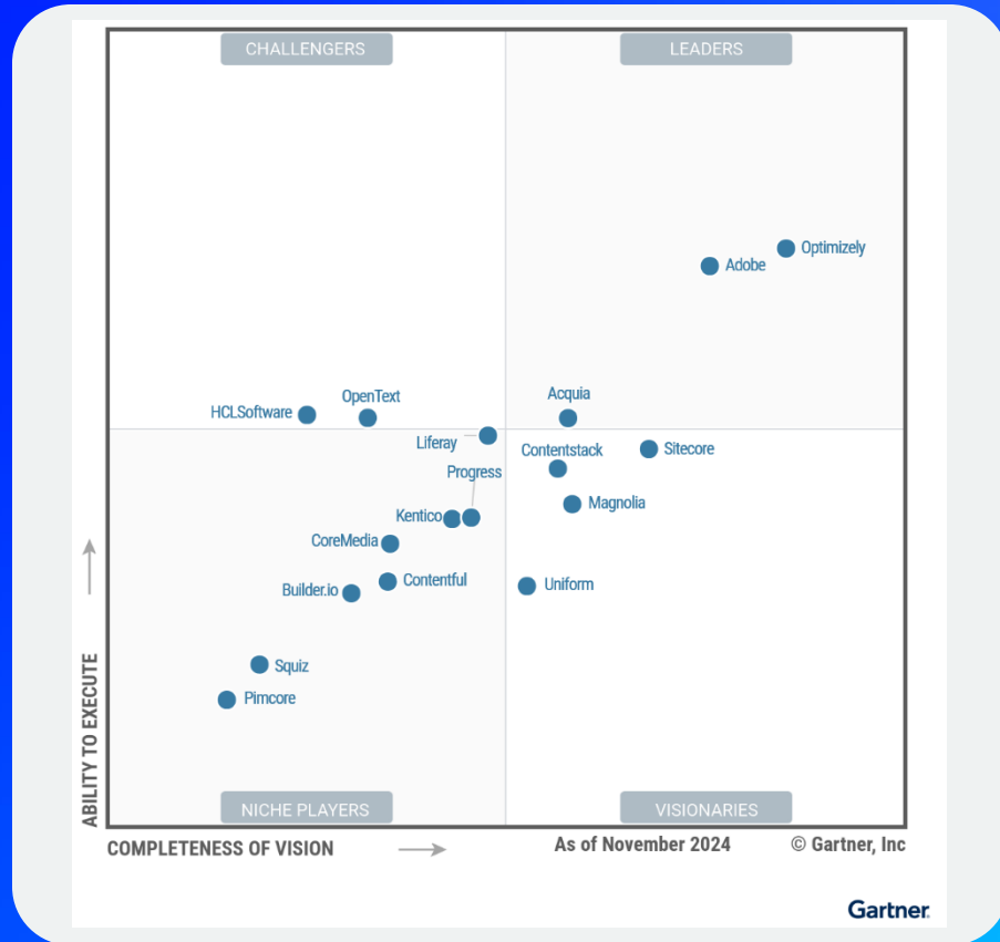
2025 Gartner® Magic Quadrant™ for Digital Experience Platforms

#1 for 'Ability to Execute' #1 for 'Completeness of Vision'